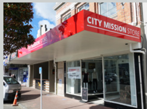
Our new store at 228 Jackson Street, Petone.

In August The Mission joined Petone's lively op-shopping scene with the launch of our brand new City Mission Store on Jackson Street!