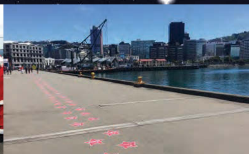
The Walk of Fame along Wellington’s beautiful waterfront