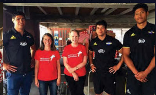
Hurricanes players helping sort donations