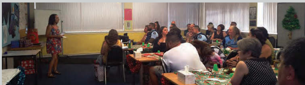
The Mission for Youth graduation ceremony

We're so proud of all the students who graduated, and those who are still part of the MFY family and are working towards their goals this year. We can't wait to see what 2018 will hold for each of them – and for the new students who will come to MFY this year!