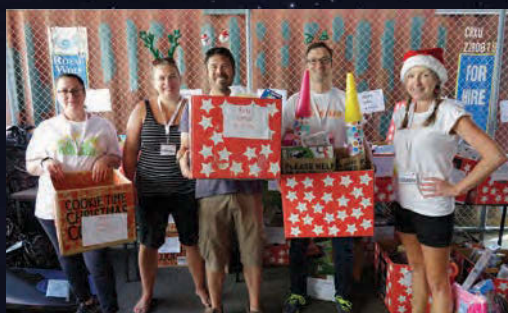
One of the many volunteer groups that helped sort food and gift donations