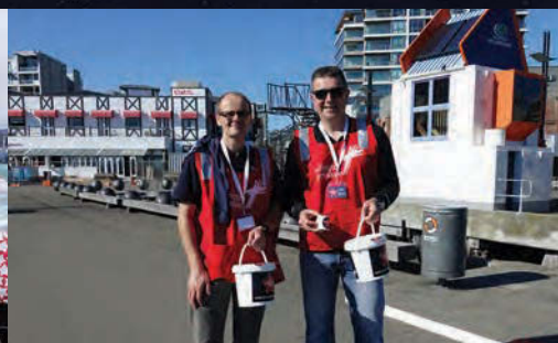
Some of our amazing volunteer collectors on Street Day!