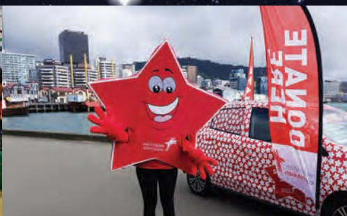
It was fantastic to have Starry out and about during the Christmas Star Appeal