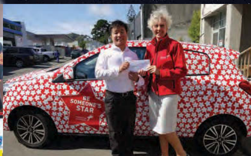
The winner of a 2017 Mitsubishi Mirage in our Christmas Raffle