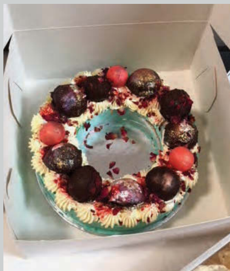
One of the special cakes donated through the 'Christmas Cake Run'