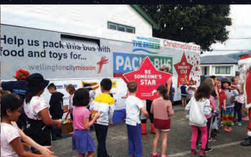
We celebrated 25 years of Pack the Bus! Thanks to The Breeze and everyone involved