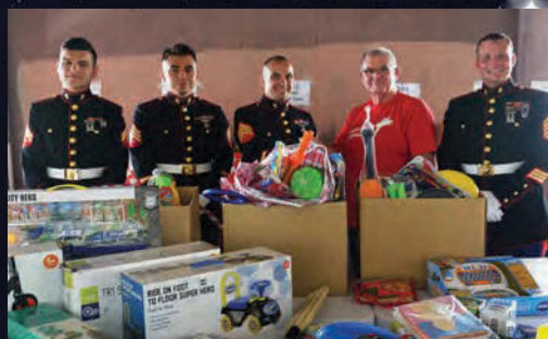
The US Marines donating toys for families in need