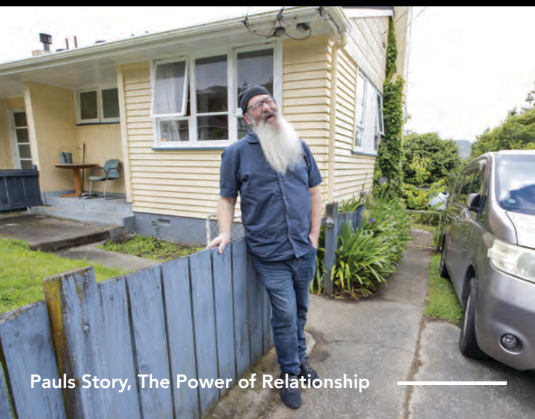
Pauls Story, The Power of Relationship

The lockdowns of 2020 revealed how vital connection is. This prompted us to make significant changes to our drop-in centre. Instead of offering a soup-kitchen style model, we changed the focus of our drop-in centre from just providing food to providing a sense of community. Renamed Tā te Manawa, our refreshed community lounge provided a cafe style environment with barista coffee and table service. Manuhiri are encouraged to stay and chat with staff and volunteers, enabling meaningful connections. These changes enabled us to find out how we could support those feeling isolated even more.