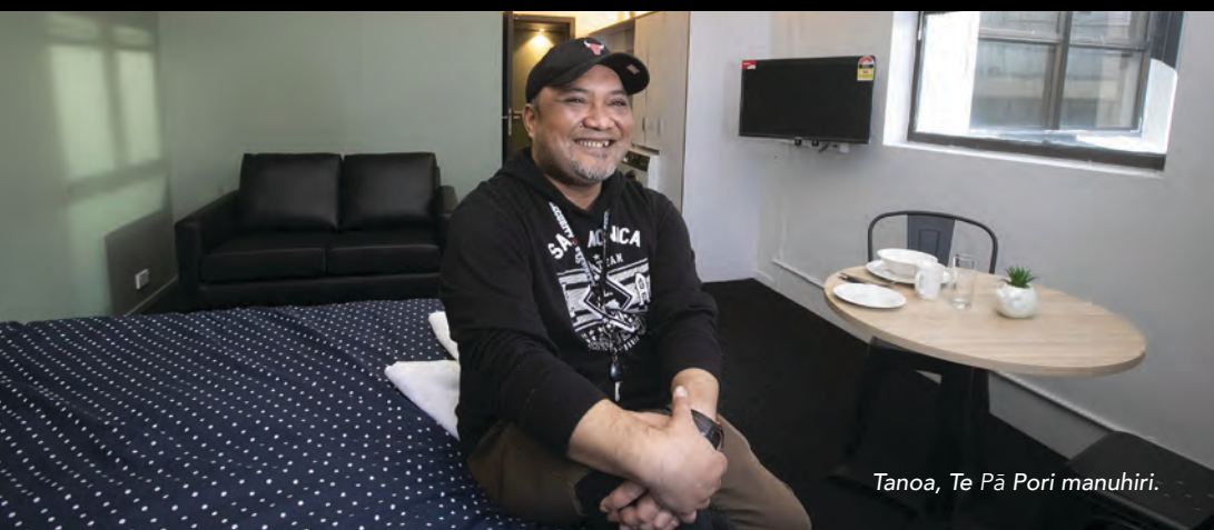
Tanoa, Te Pā Pori manuhiri.

Te Pā Pori, Te Pā Manawa and the soon to be opened Te Pā Maru form Te Pūnaha Pā. Te Pūnaha Pā is a collective of pā drawing on the principles of Tikanga Maori.